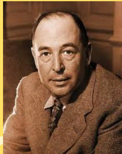
C.S. Lewis, 1898-1963

As you begin this bright new year, we invite you to join the adult book discussion group to read and share your views on Mere Christianity by celebrated and distinguished author C.S. Lewis. See religion with “fresh eyes” as you read and discuss a powerful, rational case for the Christian faith, drawing from Lewis’s perspective.